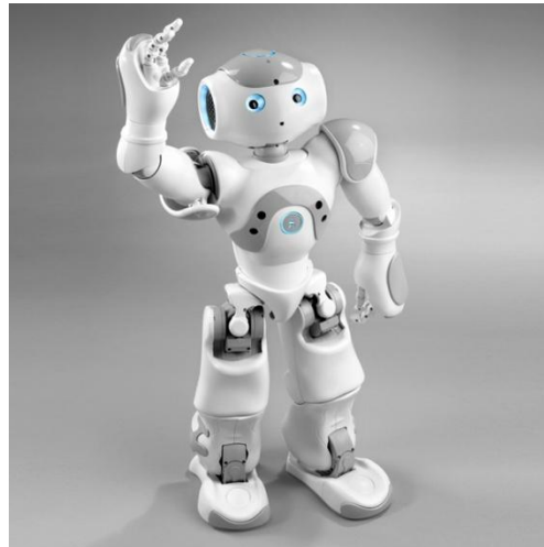
NAO Humanoid Robot (from Aldebaran Robotics) gesturing during social interaction.