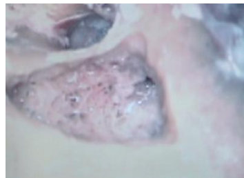
Snapshot of Temporal Bone After Surgery.

A surgeon's moves are emulated by a robot to perform some basic steps in the Mastoidectomy surgery.