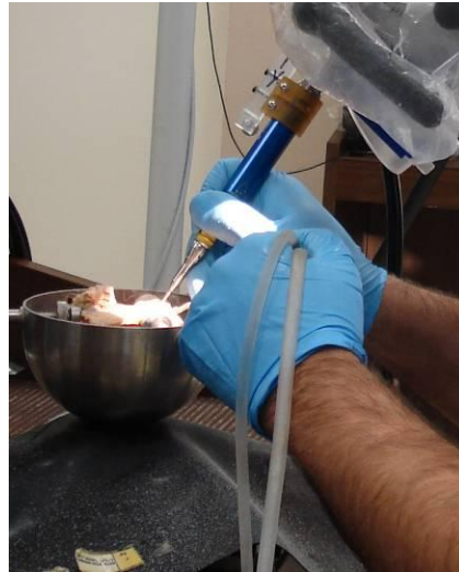
A surgeon performing Mastoidectomy on a temporal bone.