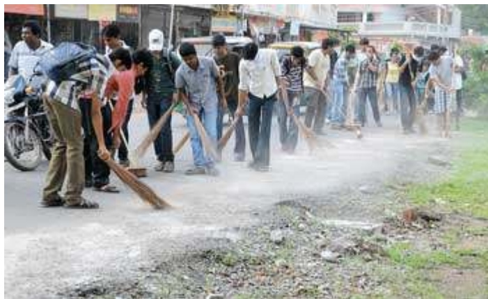
With the help of AMC, the cleanliness drive was conducted at the Chandkheda ward on Thursday

Taking a leaf out of Ahmedabad Mirror's cleanliness campaign, IIT Gandhinagar has included cleanliness as part of their foundation course. The first among the IITs across the country, this is a new concept that the institute has introduced to inculcate basic social values.