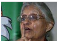
Delhi CM Sheila Dikshit at a meeting in New Delhi