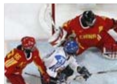
Women hockey players at the Vancouver Olympics