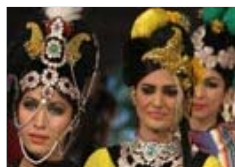
Participants during a fashion show in Lahore