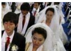
Couples in a mass wedding ceremony in Goyang